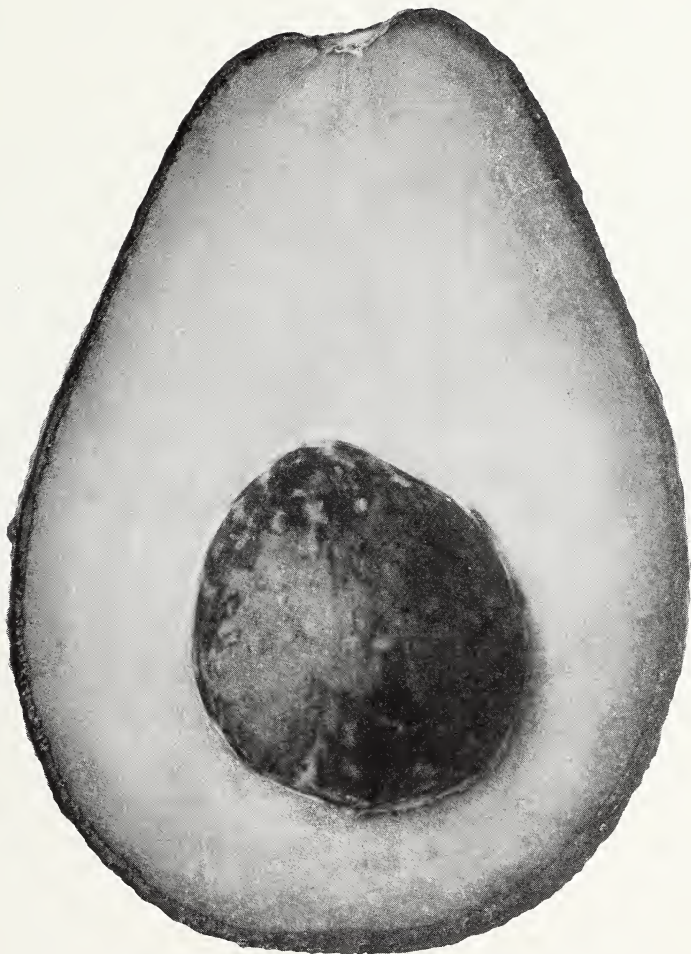
Fruit of Queen Variety, Actual Size—Seed 7\frac{1}{2}\% .